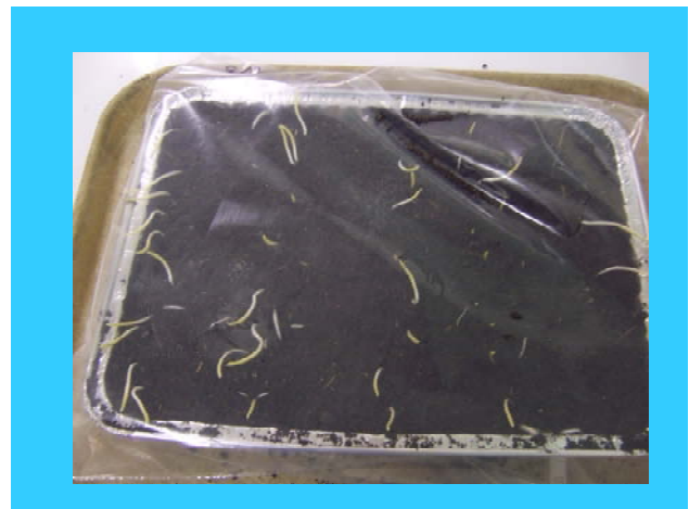
Figure 2. Emerged seedlings in laboratory emergence study.