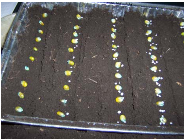
Figure 1. Pan, soil, seed, and fertilizer before covering with soil in laboratory

Nlin (SAS) procedures [both linear (L) and plateau-linear (PL)] were used to define the resulting response curves (final stand regressed on fertilizer rate (lb/a material)).